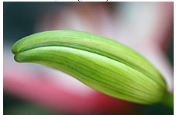
Figure 1. No distracting background: See that big white area patch behind the pre-blossomed flower? Get rid of it -- the viewer's eye will go there first.