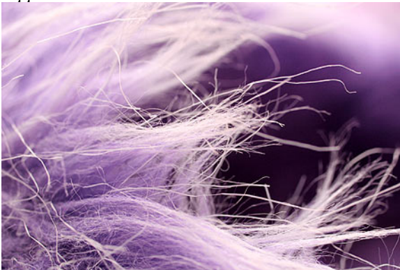
Figure 3. Transform the mundane: Look at what happened when I shot a 1:1 macro detail of my daughter's fuzzy slippers!

Once you've eliminated the variables, it's time to have fun. Keep shooting, and don't be afraid to experiment. Shoot closer, and closer still. The closer you get, the more will be revealed for your waiting camera. Enjoy exploring and photographing the tiny worlds that await you!