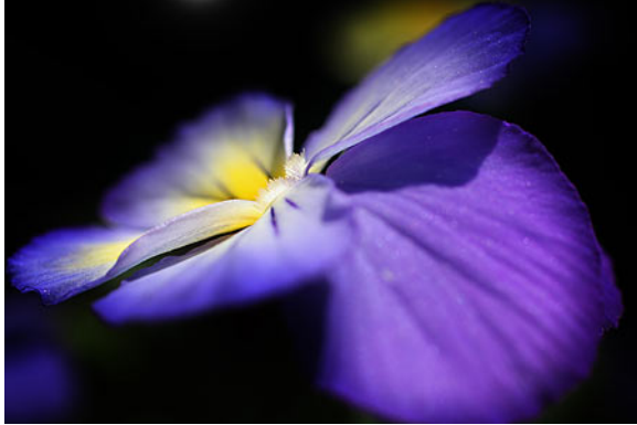
Figure 2. Be bold: Don't be afraid of dramatic colors and lighting when composing in macro.

10. Eliminate bland subject matter: Be bold in your composition, look for stunning color, and don't be afraid to experiment and create abstractions. The greatest benefit of Macro is how it transforms mundane subjects into worlds of wonder by enlarging them far beyond what the human eye is used to seeing. Pump up your digital camera's color and contrast settings if that suits the subject. With a film cam, use super-saturated film.