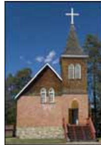
Arnold Dubin 1 st place