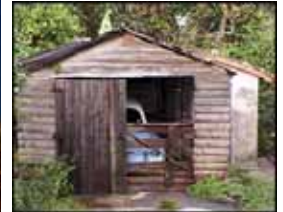
Stan Crandall 3 rd place

Go to this link www.ccbrevard.com/theme_winners.html to see larger photos and details about them.