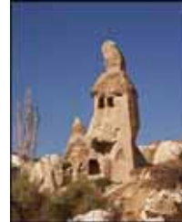
Stan Crandall 2 nd place