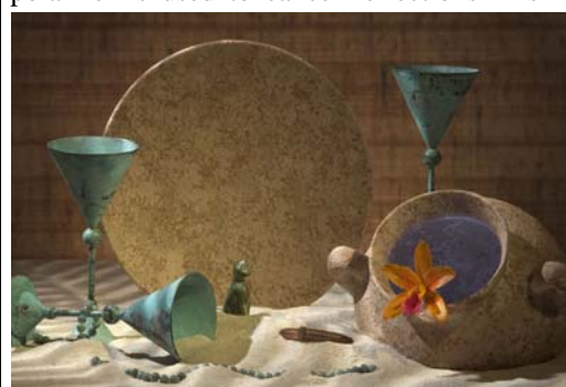
"Buried Treasure" by Carlos Davis . Flashlight in pot on right, glass with texture used in front of light for shadow on left, wallpaper used as background, and faux finish applied to plate and pot.

Lighting was created using floodlights, snoot lights, soft box, diffusers, reflectors, glass with textures, and flashlights. Brightness controls were used to dim the tungsten lights as needed. A circular polarizer is used to cancel reflections in shiny objects. The f -stop