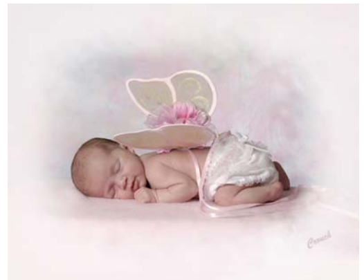
One of many outstanding photographs by Sue Crouch .

Sue suggests that you learn the rules for portrait lighting but know when to break them. She also suggests that you concentrate on forms when