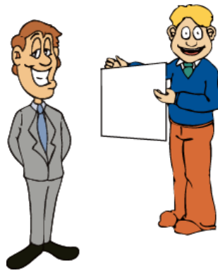
Assistant holding a reflector

Another method that can be used to reduce the contrast is to use a reflector. There are a number of commercially made ones available through the internet or by going to Southern Photo. You can also make one yourself by using a reflective surface of some kind. This could be a piece of white paper or the light colored wall of a large building, or the white sand at a beach. On the beach, you could position your subject just inside an area of shade and let the light reflecting off the sand illuminate