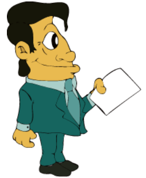
Subject holding a reflector

stand well within the flash range for the flash unit and ISO setting. Then shoot. The camera computers will judge how much flash fill is needed. If you want the background to show up, then use the slow sync setting on the camera or set the f -stop to get the correct exposure for the distance from the flash to the subject and then set the shutter speed to get the correct exposure for the background. The shutter speed needs to be slower than the fastest flash sync shutter speed for the camera.