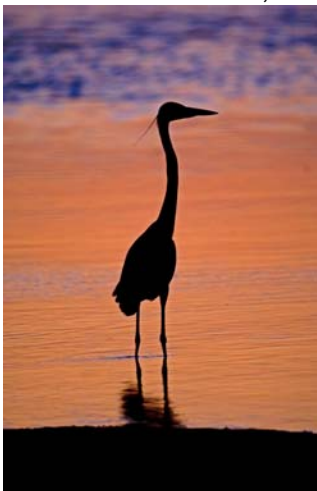
Honorable Mention Photo by Charlie Corbeil .